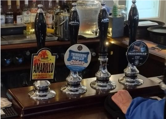
Beer of the day in pub of the day. Crouch Vale's Amarillo in the Three Horseshoes, Stapleford.