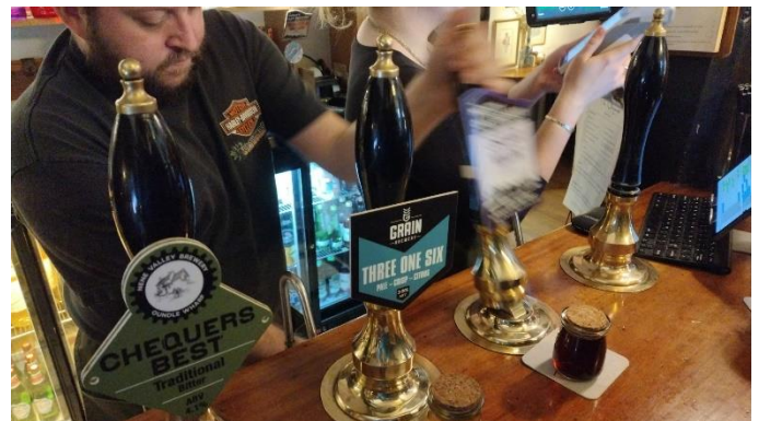
This isn't a slow shutter speed, this lad was seriously quick....honest!