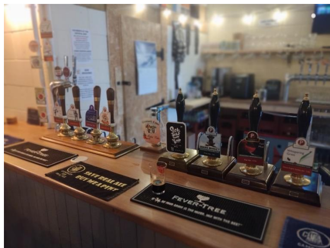
The Crystal Ship and 8 real ales and a cider on pumps; impressive!