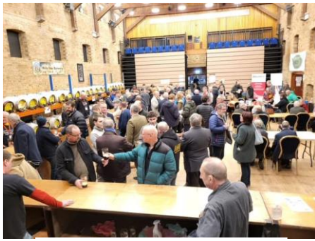
Opening Trade session on Thursday