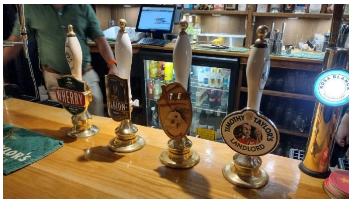
The Three Tons at Fen Drayton. Beer of the day for some of us was the Xtreme Ales Pigeon Ale....and pub of the day to some too!

passengers and I caught my train back some one-hour late but who cares.