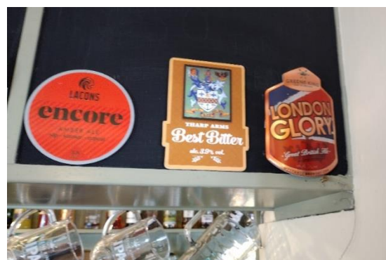
Tharp Arms Best Bitter. Using the family crest of the Tharp family that owned Chippenham Park for a century